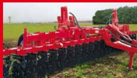
CROWN No-Till Units