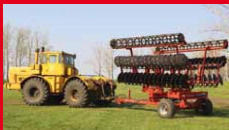
THALER System Carriers