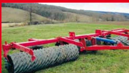
POUND Land Rollers