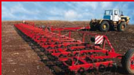
LIRA Hydraulic Spring-Tooth Wide Level Harrows