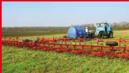
REAL Units for Spreading of Plant Protecting Agents and Liquid Mineral Fertilizers