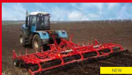
CHERVONETS Seedbed Cultivators