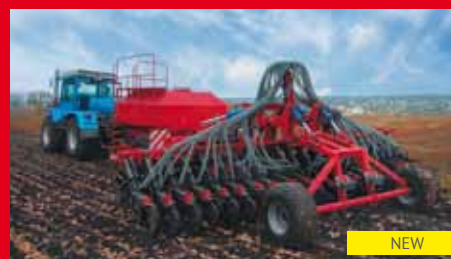
ZLATNIK No-Till Seed Drills