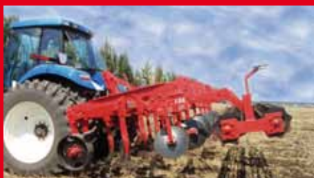
SHILLING Stubble Cultivators