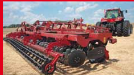
DUCAT Compact Disc Harrows